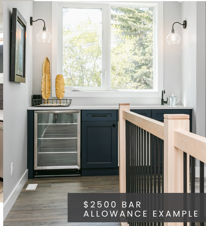
$2500 BAR ALLOWANCE EXAMPLE