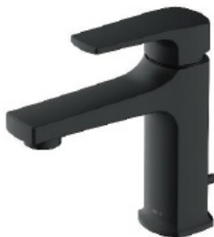
SINK FAUCET Tribune Sink Faucet