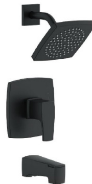
TUB & SHOWER KIT Tribune Tub & Shower Trim