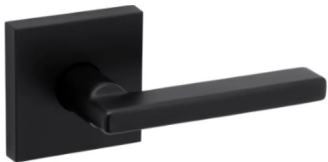
DOOR HANDLE Matte Black Interior Handle