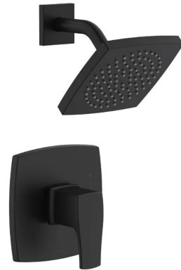
SHOWER KIT Tribune Shower Trim