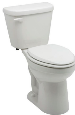
TOILET Maxwell High Efficiency Toilet