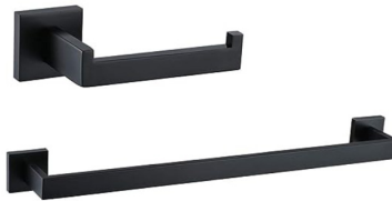
BATH HARDWARE Matte Black Bath Hardware