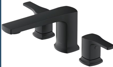
TUB FAUCET Triune Tub Faucet