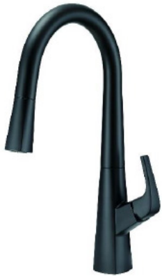
KITCHEN FAUCET | Vaughn Pull Down Faucet