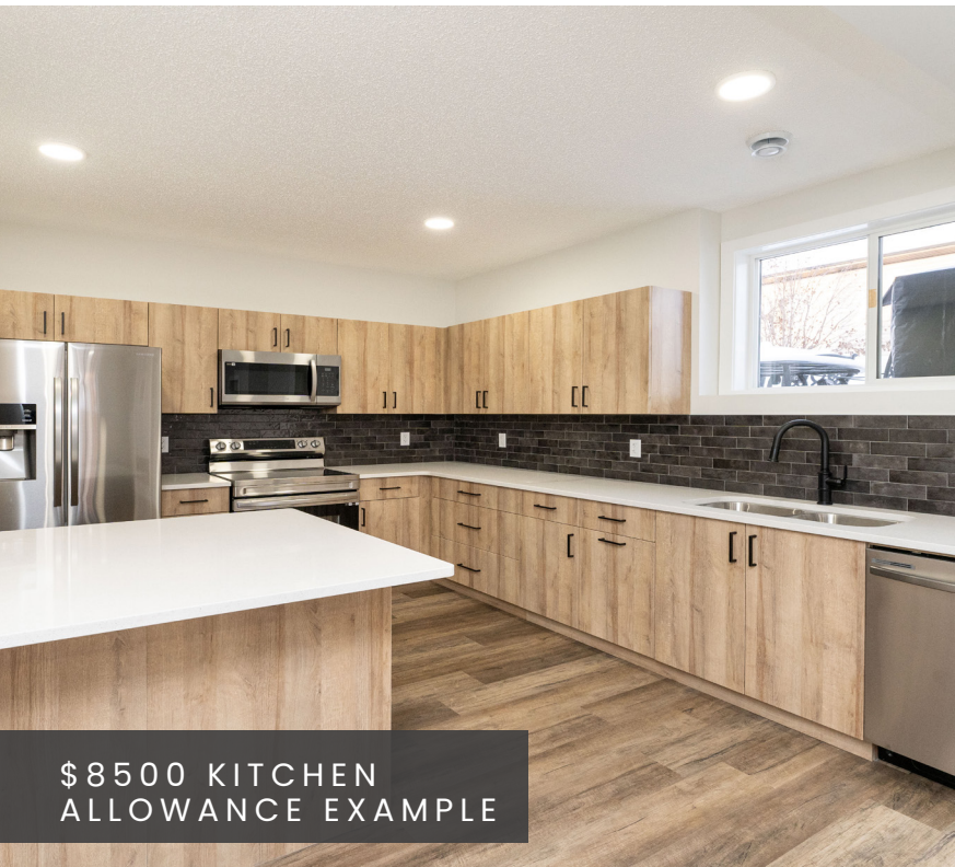
$8500 KITCHEN ALLOWANCE EXAMPLE