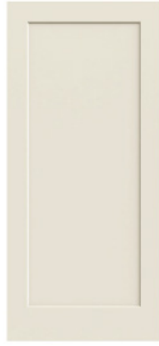
INTERIOR DOOR Madison