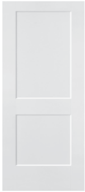
INTERIOR DOOR Logan or Monroe