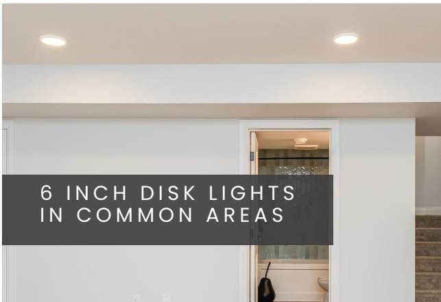
6 INCH DISK LIGHTS IN COMMON AREAS